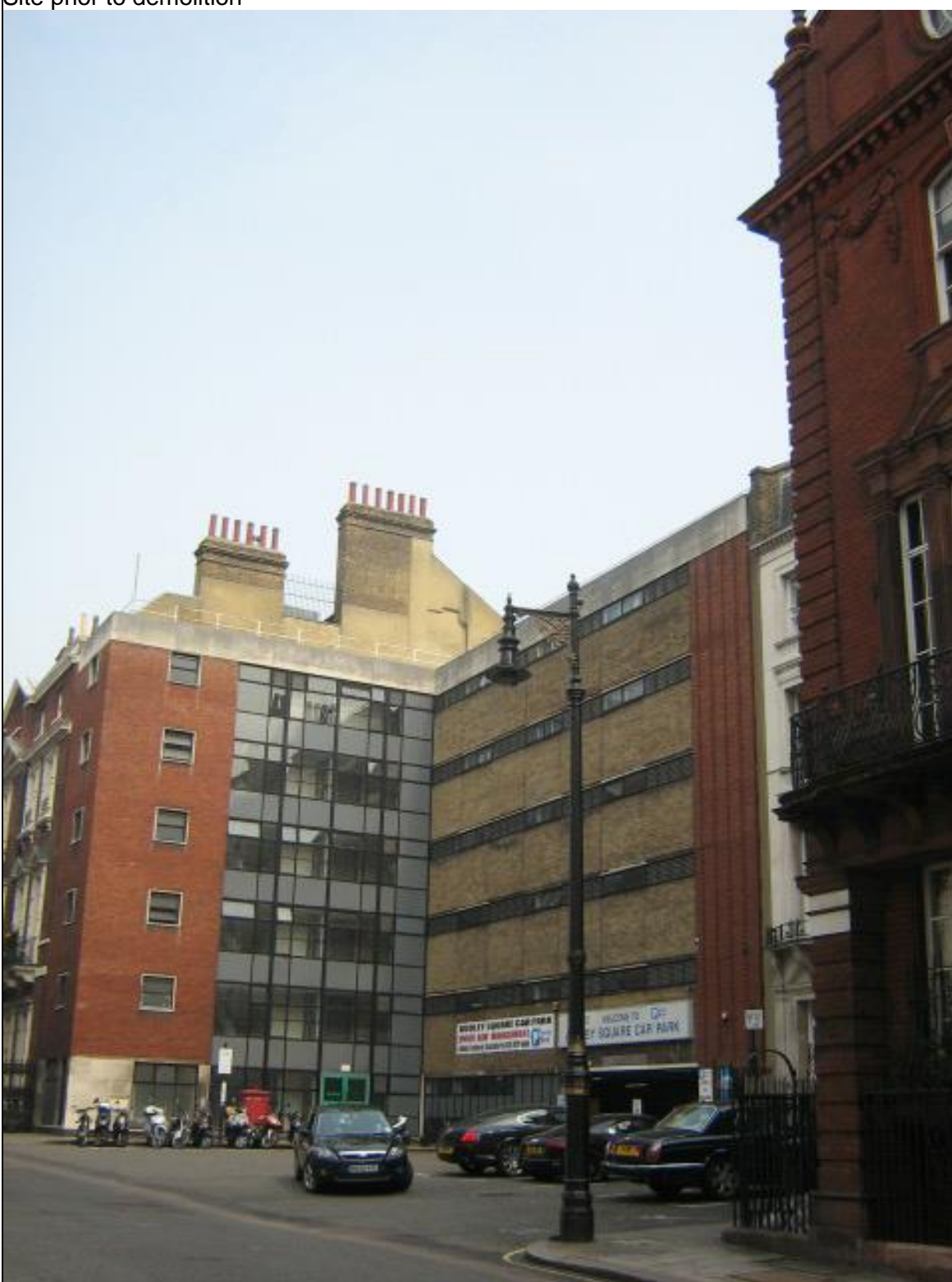
Site prior to demolition